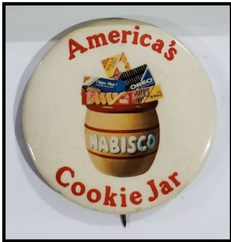
To the left is a pin Nabisco created again promoting the Cookie Jar!

Below we have two examples of the same physical Cookie Jar but with no red paint accent and with a white lid on one pictured to the right. The bottom is the same on both with the McCoy mark like the high volume red trimmed examples. This may have been a couple of paint color decoration options for Nabisco to consider. Or Nabisco may have ordered a smaller quantity of these other variation. But examples with this coloring trim are not as commonly found and given it was an exclusive piece of Nabisco, they might be a nice consideration for addition to any Cookie Jar collection.