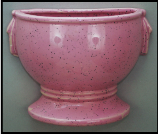
Above; the production pink glaze with black flecks

The Urn is another 1956 introduction. The catalog number is "WP19". The wall pocket is 4-1/2 tall and 5-3/4" wide. The production glaze offerings were pink with black flecks and chartreuse with brown flecks.