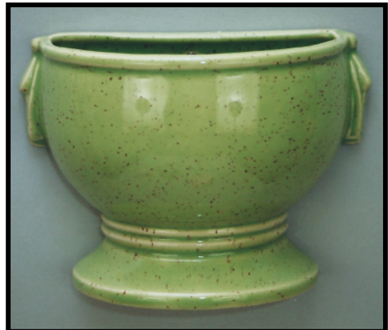
Right; the production chartreuse glaze with brown flecks.

Left is the back of the wall pocket showing the "McCoy USA". This is the back of a gold trim piece as you can see the Shafer 23K Gold stamp, typical of how Shafer marked many of their gold trim pieces.